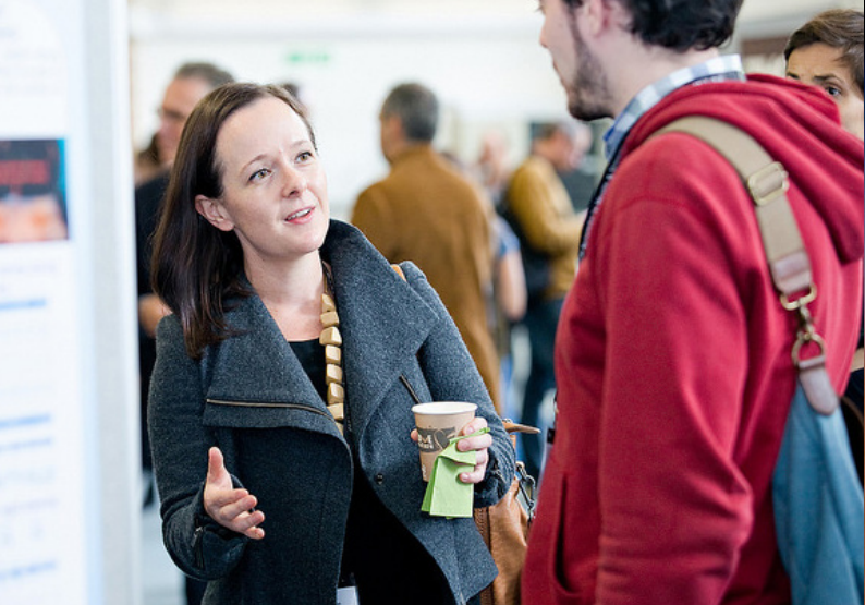
Institute of Psychopharmacology, Central Institute of Mental Health, Medizinische Fakultät, Universität zu Köln, Institute of Molecular Biology and Department of Theoretical Neuroscience, Central Institute of Mental Health, Medical Faculty Mannheim